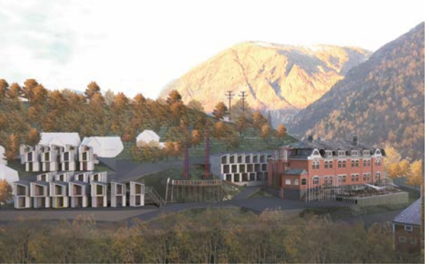
Figure 1: D. Maj's winning engineering work for The Wire Figure 2: M. Przydział's winning Master's work for project.